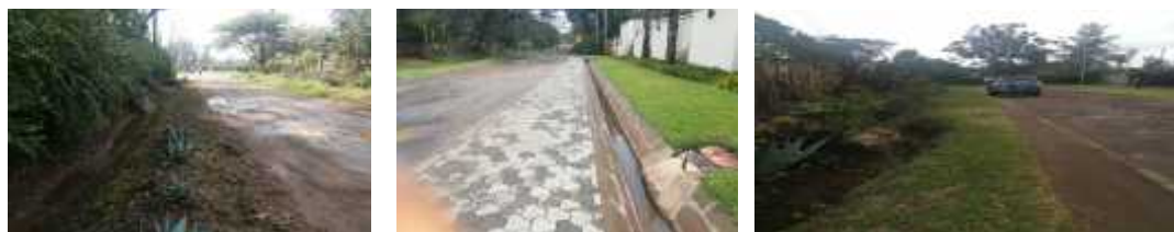
Photos of current status of the road

The length of the roads is approximately 0.6km