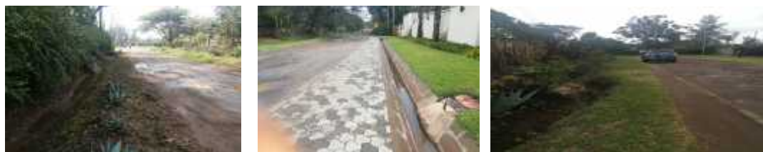
Photos of current status of the road

The length of the roads is approximately 0.6km